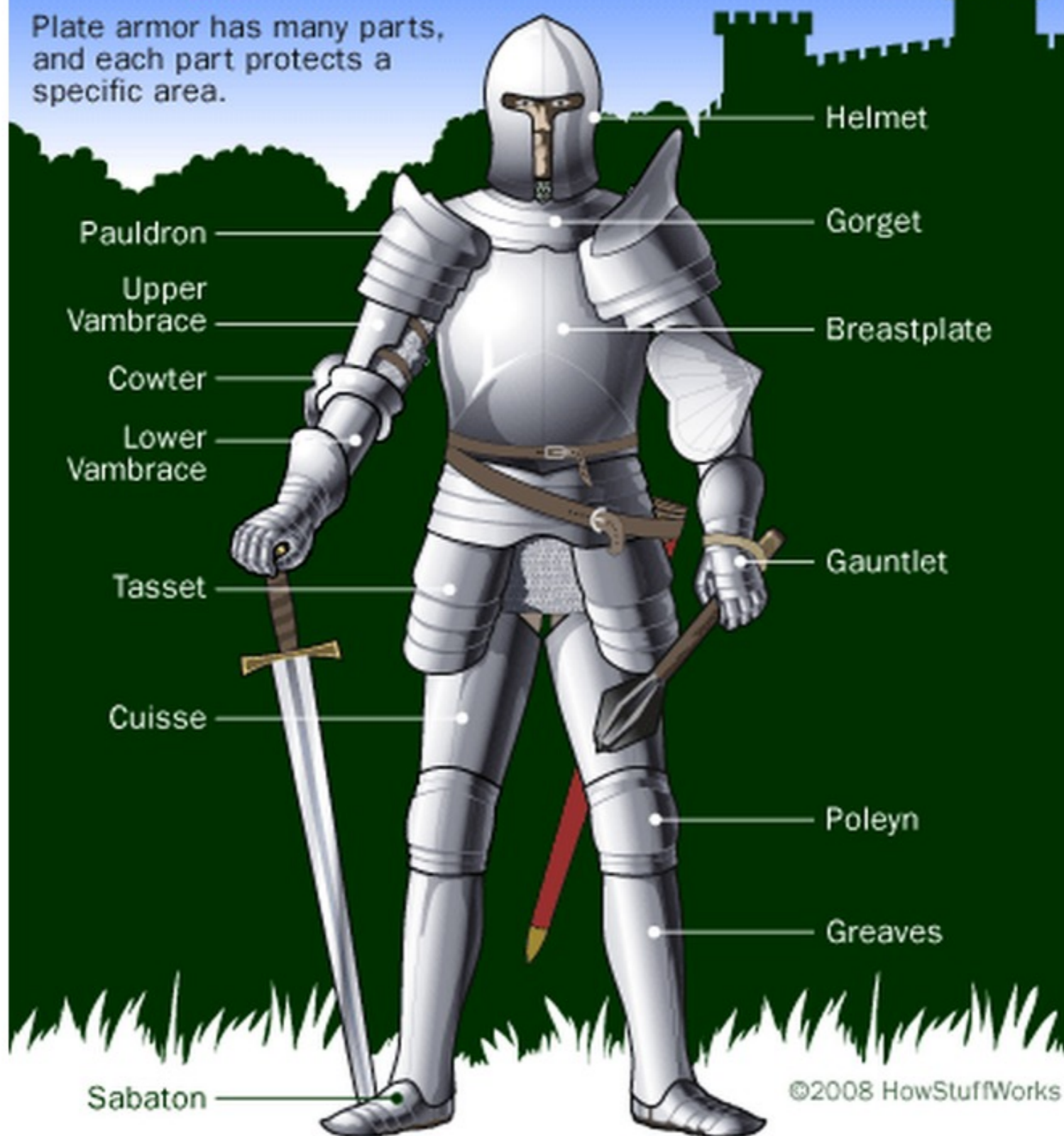
Plate armor has many parts, and each part protects a specific area.